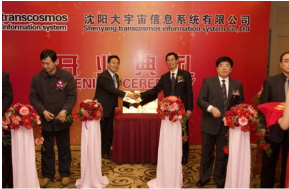
※Fig. 1 Photos of Inauguration Ceremony and Data Entry Center

In the past, the data entry sales in China was mostly offshore business coming from Japan, however, to comply with the sales expansions in China, transcosmos will offer data entry services in Chinese for Japanese businesses that are marketing in China. Taking advantage of the data entry experience sustained for over 40 years, transcosmos will provide even more superior quality services.